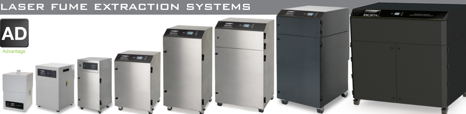
AD Access AD 350 AD Nano AD Oracle SA iQ AD Oracle iQ AD PVC iQ AD 500/1000/1500 iQ AD 2000 iQ

BOFA's range of ADVANTAGE laser fume extraction and filtration systems are designed for applications that generate particulate and gaseous volatile organic compounds (VOC's) within the