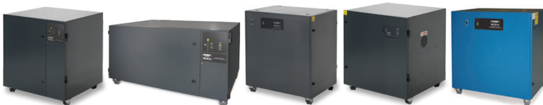
AD Base 1 Oracle AD Base 2 Oracle AD Base 3 AD Base C180 AD Base Z

BOFA's Base range of fume extraction systems are purpose built for laser engravers to sit directly on top, incorporating BOFA's filter technology and optional on-board compressor.