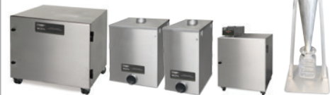
ILF1000 ILF600 / 300 FireBOX Cyclone

Extends filter life for use on applications that create large amounts of particulate and dust.