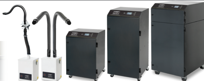
V200 V250 V Oracle SA iQ V Oracle iQ V 500/1000/1500 iQ

BOFA's range of Tip and Volume solder fume extraction systems are designed for applications that generate fume including resin acid particulate and gaseous organic compounds within the