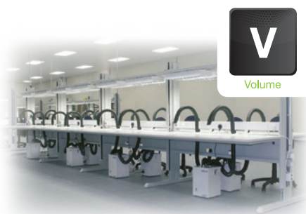
TVT2 T1 T15