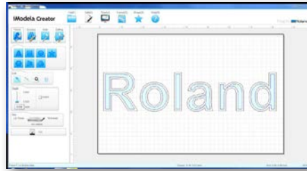
iMODELA™ Creator is software for processing 2D data such as text and graphics.