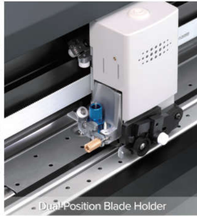
Dual-Position Blade Holder