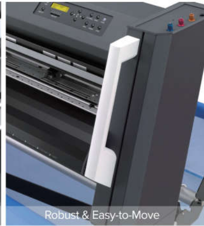
Robust & Easy-to-Move