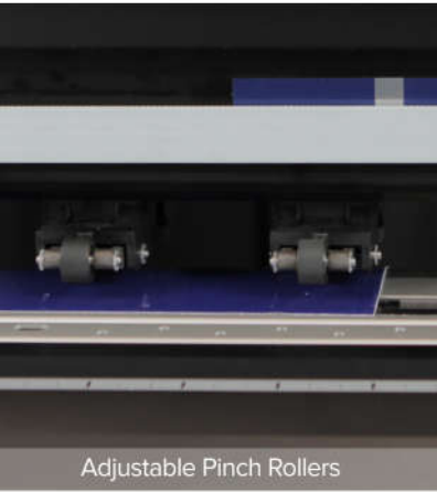
Adjustable Pinch Rollers